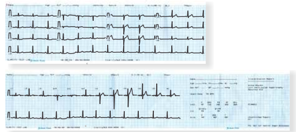
4/6 Ch ECG Report with Average Complexes, Quantitative Analysis and complete Interpretation